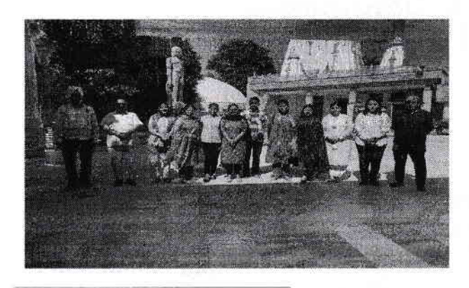
Jain Temple, Sector-27, Chandigarh

The first destination was the Jain Temple in Sector 27, Chandigarh where it was observed that the temple is dedicated to Lord Mahavira, the 24th and last Tirthankara of Jainism. The temple has a beautiful marble structure with intricate carvings and paintings depicting the life and teachings of Lord Mahavira. The temple is of the "Digambar" sect. The students explored and enquired about the principles of Jainism, such as non-violence, truthfulness, non-attachment and non-stealing. They also explored and enquired about the concept of karma, rebirth and liberation in Jainism.