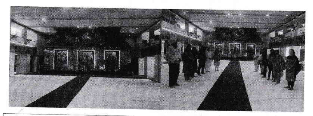
Sanatan Mandir, Sector-27, Chandigarh

They also explored and enquired about the Vedas, the Upanishads, the Bhagavad Gita and other sacred scriptures of Hinduism.